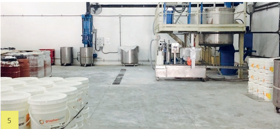
1. Image of the entrance of the main warehouse. Graphenstone China Factory (Jinan). 2. Meeting of the leadership of Graphenstone China (Jinan). 3. Main warehouse. Graphenstone Panama. 4. New facade decoration of the Graphenstone Panama Factory. 5. Industrial paint mixers in the production area. Graphenstone Panama Factory.