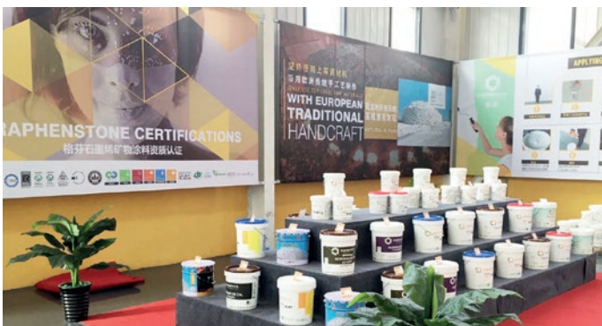
Principal hall of Graphenstone China Factory (Jinan).

In addition, we recently opened our new showroom to the professionals in the field. A meeting place where every client receive a fully personalised attention and they can see and touch the Graphenstone samples displayed. Furthermore, we have two other industrial plants strategically located in Panama and China. The first one provides the market in North America, Central America and South America with Graphenstone products; and the second one is devoted to cover the China demand.