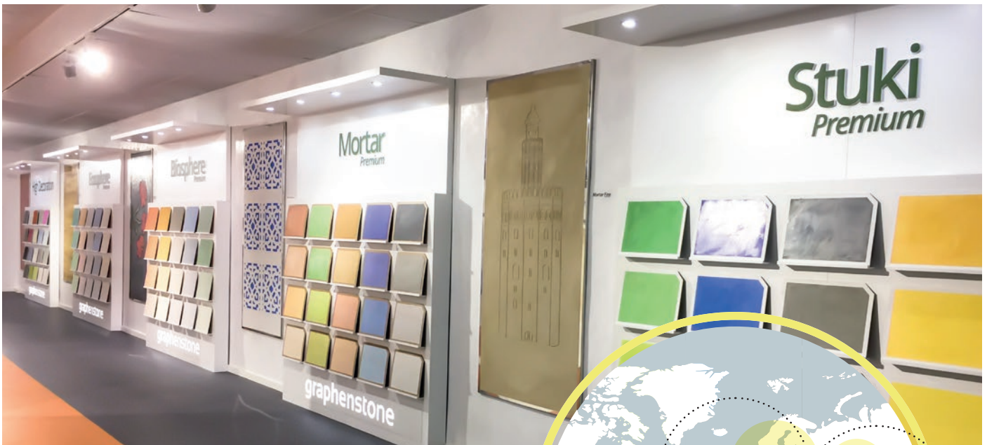
Graphenstone Spain Headquarters. Exposition & Showroom.

The rising demand of Graphenstone products made us settle three production plants in three different continents.