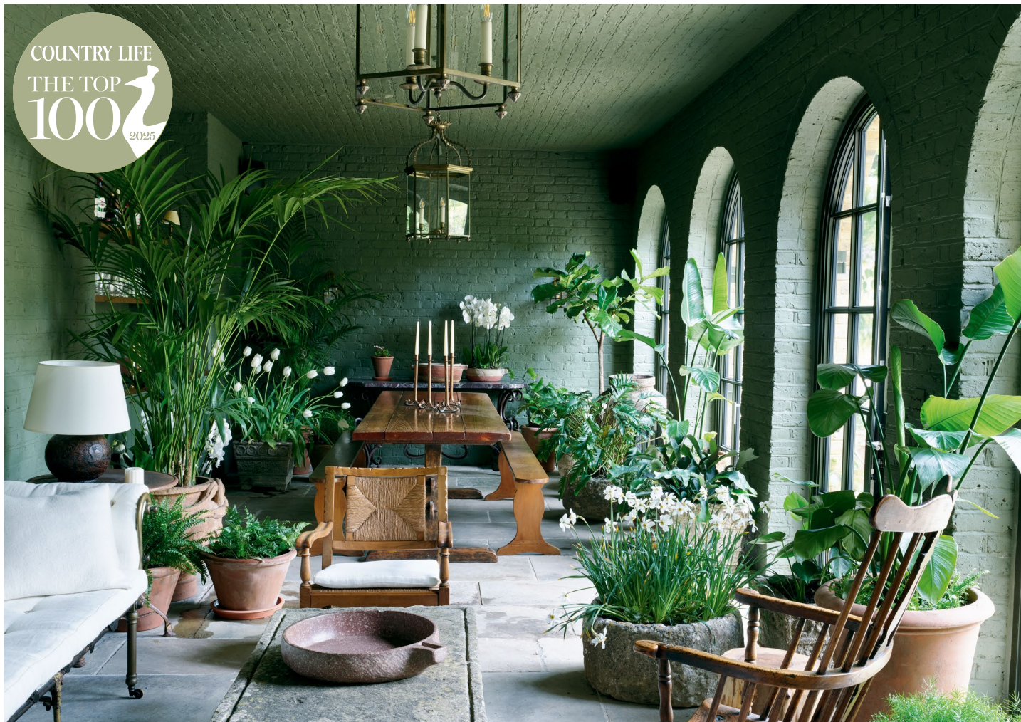
NEW ENTRY This soothing space is in Moor, by the specialist paint manufacturer Graphenstone, for interior designer Rose Uniacke

creating calm and personalised landscapes that subtly unify with the architecture of the houses they surround, as evidenced in the geometrically satisfying contemporary garden with loose natural planting at a cart-house conversion in Northamptonshire ( 'Shaping the view' , February 19). He is known for a meticulous approach and reflective water, including pools and rills.