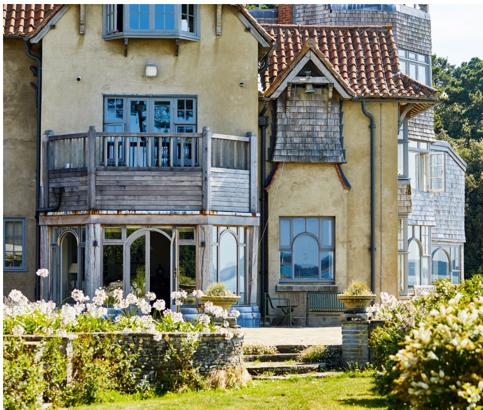
Moulding transformed this notable house with views of the Beaulieu River, Hampshire